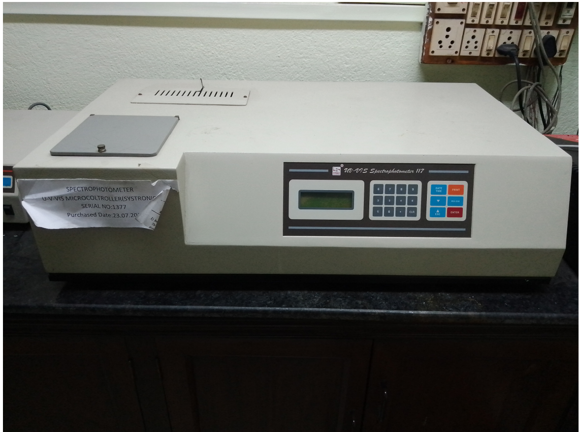
UV-Vis Spectrophotometer 117 – Systronics