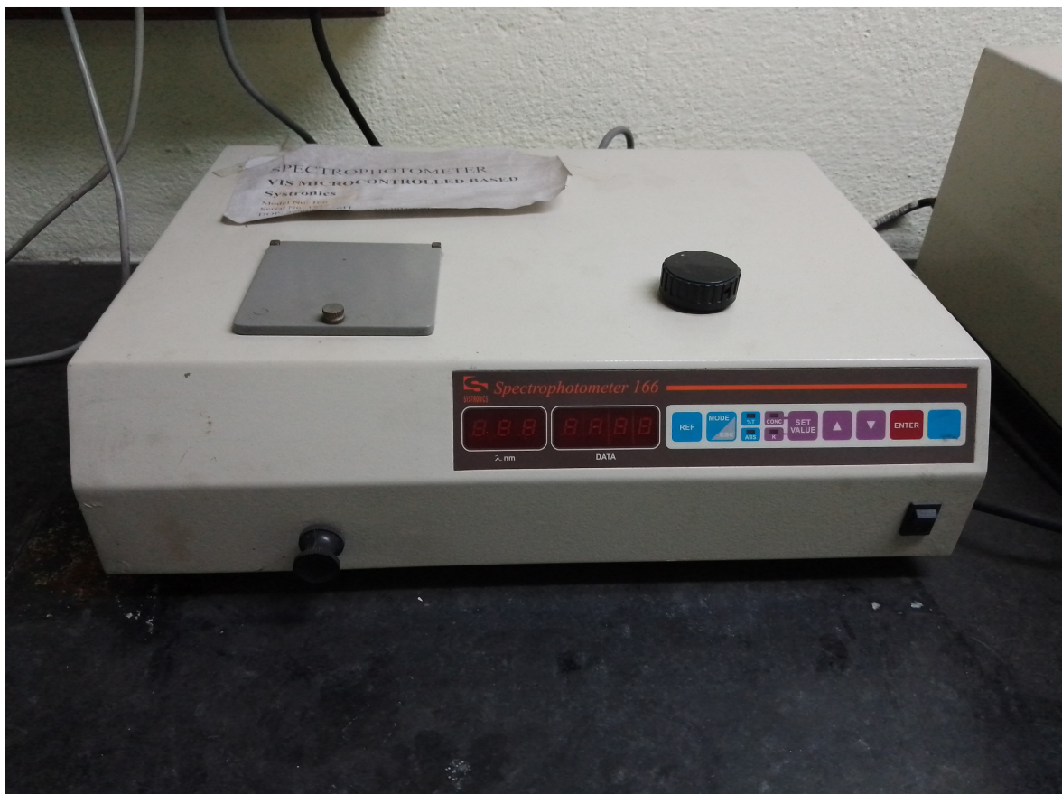
Visible Spectrophotometer 166 – Systronics