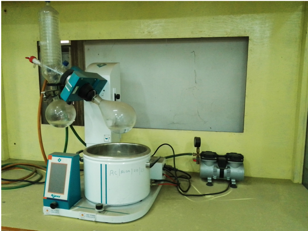
Rotavapor Rotary Vacuum Evaporator 66-V(Equitron) - Digitech Systems